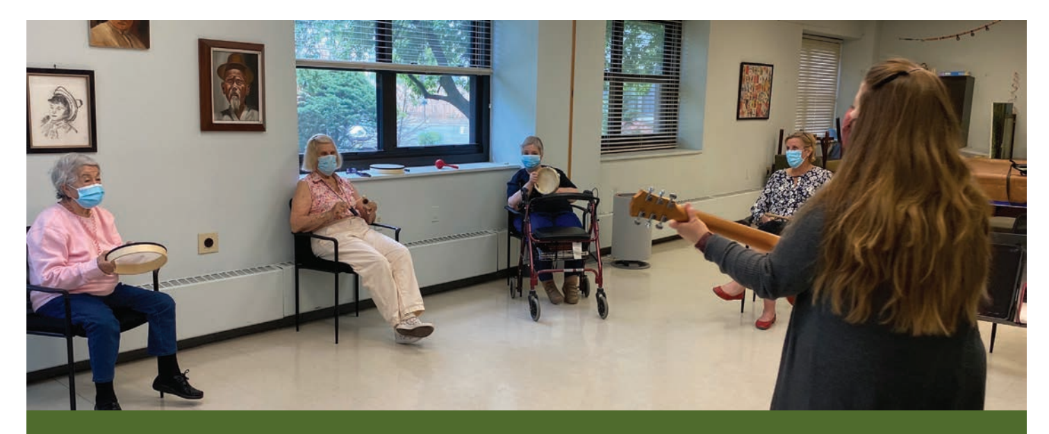
An ALP program joined up with building managers to co-sponsor a socially distant "Group Music and Chat" program to help residents safely gather together after the pandemic